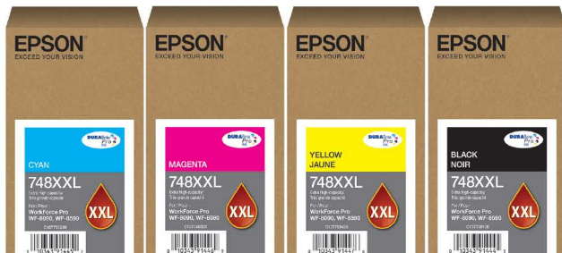
DURABrite® Pro 748 Series Genuine Epson® Ink initial cartridges 1

The cartridges included with the printer are designed for printer setup and not for resale. After some ink is used for priming, the rest is available for printing.